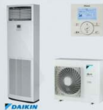
Tower type air conditioner