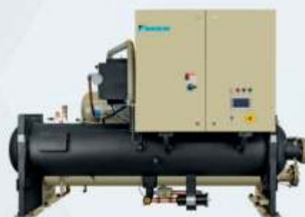
Water Cooled Screw Chiller