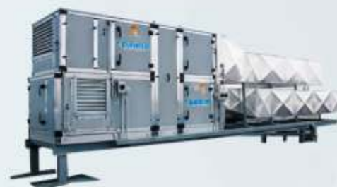
Air Handling Unit(AHU)