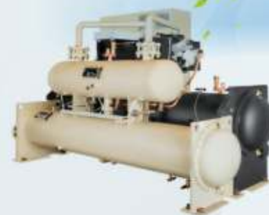
Water Cooled Screw Chiller