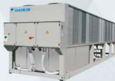
Air Cooled Screw Chiller