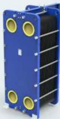
Plate Type Heat Exchanger