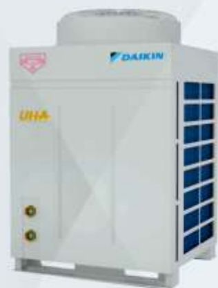
Hot Water Generator(Heat Pump)