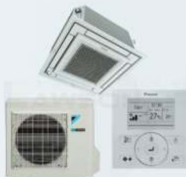
Cassette type air conditioner