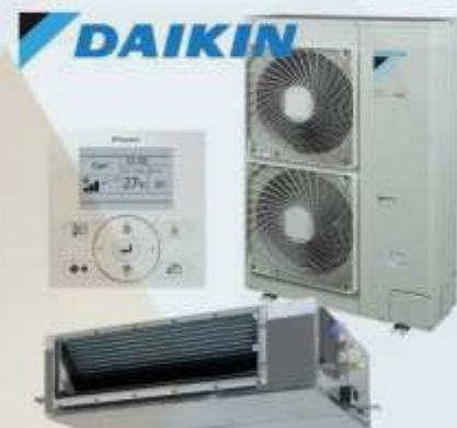
Duct able type air conditioner