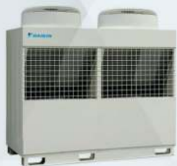
Air Cooled Scroll Chiller